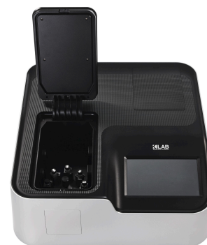
[Figure 1]. Alpha and dedicated 8-Cell Multicell Holder - Alpha is a double-beam UV-Vis spectrophotometer from K LAB, equipped with a multicell holder that accommodates up to eight cuvettes, enabling fast and efficient analysis during repeated measurements.