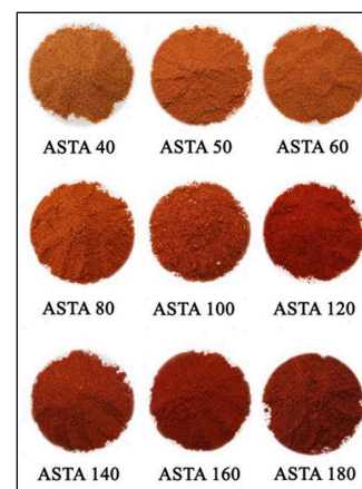
[Figure 4]. Example comparison of red pepper powders by ASTA Color grade

The 1/2 dilution sample showed an average absorbance (at 460 nm) of 0.4690, which falls within the acceptable range. The corresponding ASTA Color value was calculated as 152, and the coefficient of variation (%CV) was 3.2%, demonstrating excellent reproducibility compared to the general reference range of 5.9 – 7.8% specified in the ASTA Method.