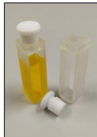
[Figure 2]. Extract solution placed in a 10 mm quartz cuvette